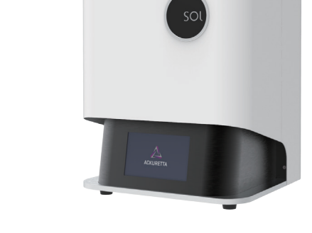
SOL 3D Printer